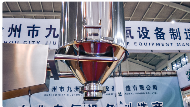
Automatic powder mixing equipment for pharmaceutical production USA

Pharmaceutical Tablet Press • 24.11.2020 • 45.780K views