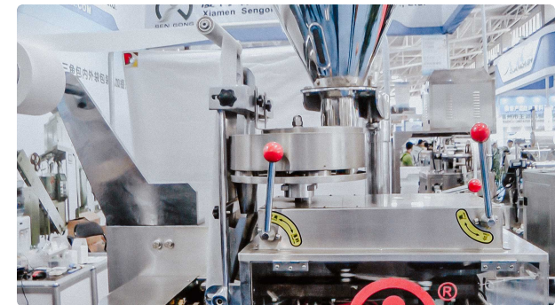
Line automatic packing tea in bags and pyramids with thread and paper label Canada

Pharmaceutical Packaging • 23.09.2020 • 78.450K views