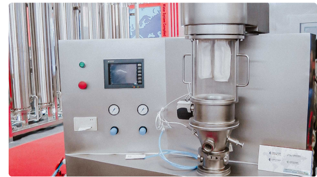
Automatic fluidized bed granulator for tablet protective coating

Pharmaceutical Tablet Press · 10.12.2020 · 95.410K views