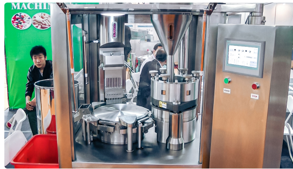
Automatic equipment for filling hard gelatin capsules with powder in pharmaceutical...

Pharmaceutical Tablet Press · 10.12.2020 · 105.410K views