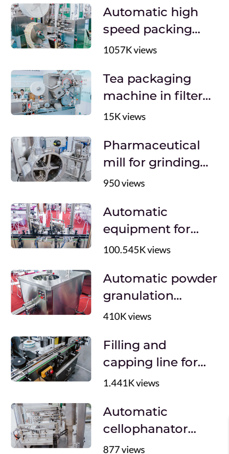
Automatic equipment for tablet production in pharmaceutical production USA