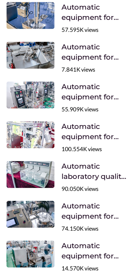
Automatic equipment for tablet packing in soft aluminum packaging in pharmaceutical production