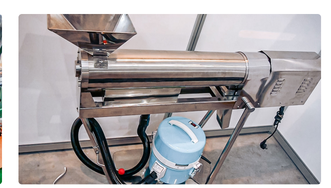
Automatic equipment for cleaning and polishing of solid gelatine capsules

Pharmaceutical Packaging • 17.09.2020 • 7.800K views