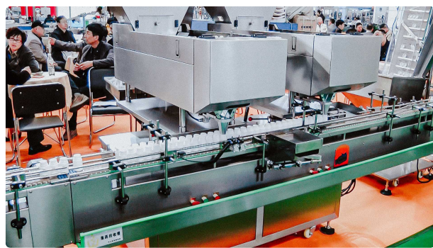
Automatic filling machine for filling hard gelatin capsules into plastic bottles

Pharmaceutical Tablet Press • 07.09.2020 • 1.647K views