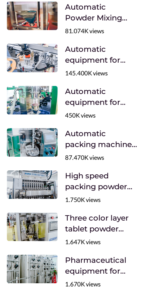
Automatic equipment for vacuum transport of powder in pharmaceutical production Portugal