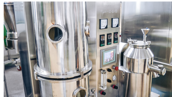
Automatic equipment for drying and granulation of powder in fluidized bed...

Pharmaceutical Packaging • 17.09.2020 • 7.840K views