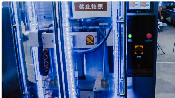
High speed automatic suspension packaging machine in long stick pouches

Pharmaceutical Tablet Press • 11.09.2020 • 1.760K views