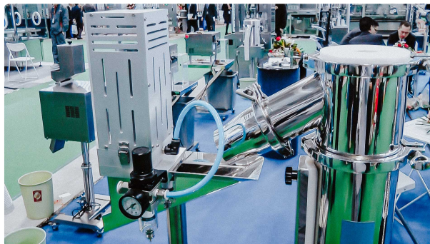
Automatic pharmaceutical equipment for checking the quality of gelatin capsules

Pharmaceutical Tablet Press • 11.09.2020 • 1.760K views