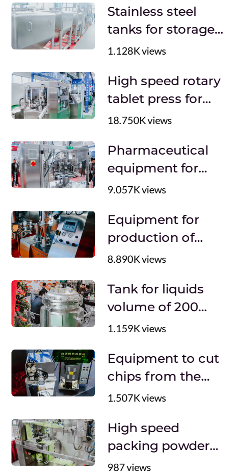
Automatic equipment to stick self-adhesive labels on penicillin vials in pharmaceutical production