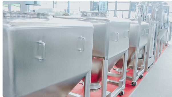
Stainless steel tanks for storage and preparation of liquid medicines

Pharmaceutical Tablet Press • 14.09.2020 • 1.225K views