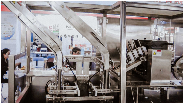
Automatic cardboard equipment for packing blister and products into boxes

Pharmaceutical Tablet Press • 14.09.2020 • 1.225K views