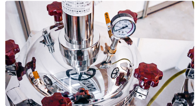
Automatic equipment for preparation of hot solutions and gel

Pharmaceutical Tablet Press • 02.09.2020 • 1.128K views