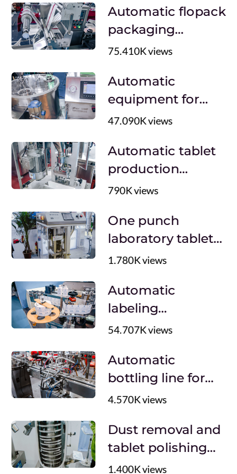
Automatic packaging line for tablets and capsules in plastic bottles capping and labeling