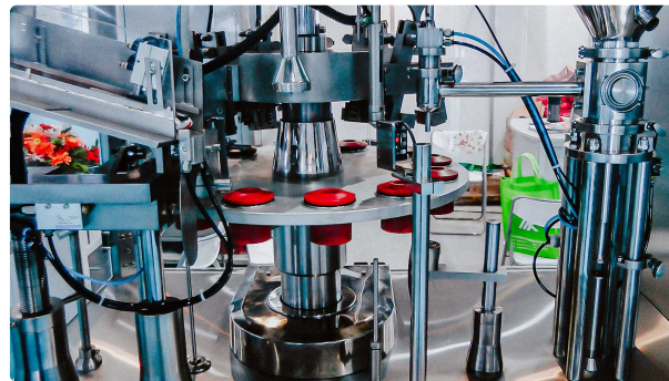
Automatic equipment for dosing and filling of plastic tubes with cream

Pharmaceutical Packaging • 23.09.2020 • 99.780K views