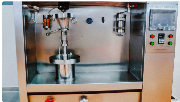
Equipment for the production of gel capsules with oil in the production of medicines

Pharmaceutical Packaging • 23.09.2020 • 99.780K views