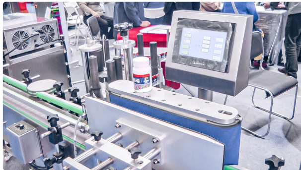
Automatic labeling equipment for plastic and glass bottles

Pharmaceutical Tablet Press • 03.11.2020 • 91.740K views