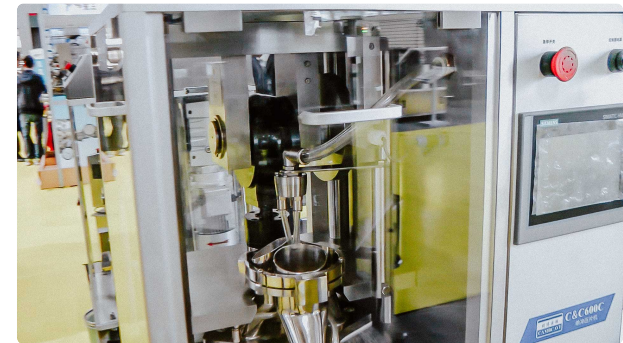
Three color layer tablet powder pressing equipment

Pharmaceutical Tablet Press • 09.12.2020 • 54.500K views