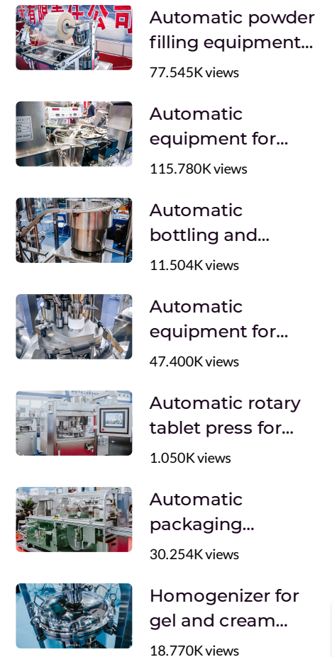
Automatic packing machine for packing powders and granules into pillow bags filter material