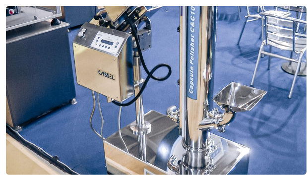
Automatic equipment for polishing gelatin