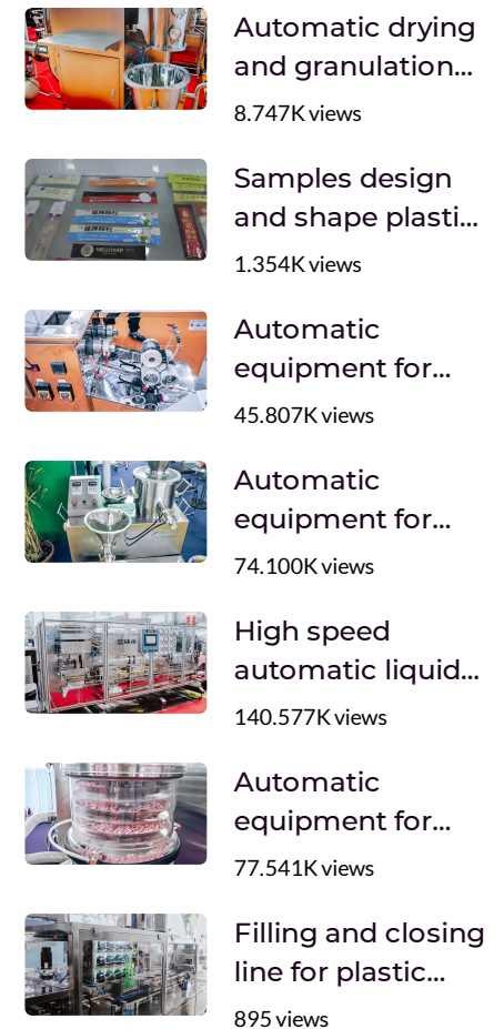
Automatic pick-up device for powder containers in the pharmaceutical production of medicines