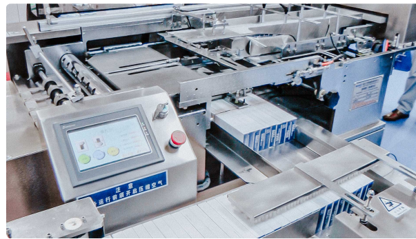
Group Cardboard boxes cellophane wrap equipment USA

Pharmaceutical Packaging · 16.09.2020 · 1.050K views