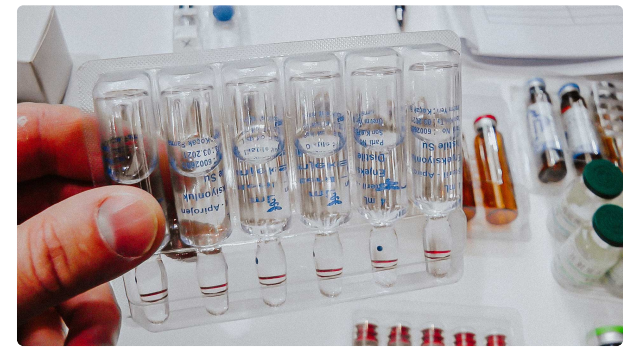
Equipment for packing glass ampoules and penicillin bottles in PVC and aluminum blister

Pharmaceutical Tablet Press · 04.09.2020 · 1.797K views