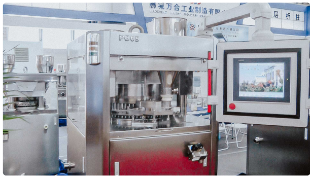
Automatic rotary tablet press for tablet pressing pharmaceutical production

Pharmaceutical Packaging · 16.09.2020 · 1.050K views