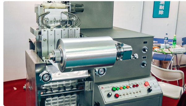
Automatic equipment for tablet packaging in soft aluminum strips in pharmaceutical...

Pharmaceutical Tablet Press • 09.09.2020 • 1.700K views