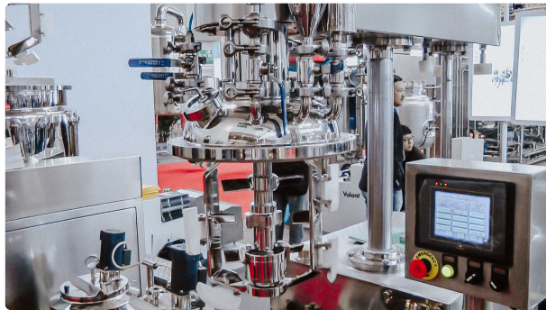
Homogenizer to prepare a cream and ointment for cosmetics and pharmaceutical products

Pharmaceutical Tablet Press • 09.09.2020 • 1.700K views