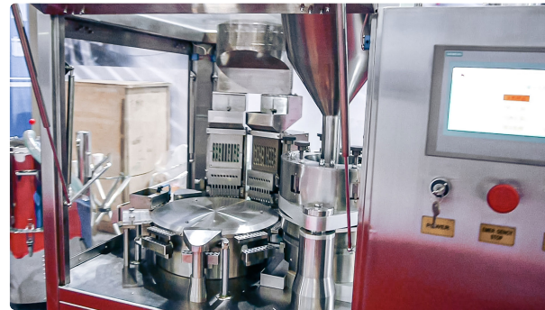
Automatic equipment for filling hard gelatine capsules with granules

Pharmaceutical Tablet Press • 11.09.2020 • 1.141K views