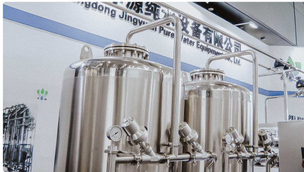
Water treatment systems for pharmaceutical drug production

Pharmaceutical Tablet Press • 11.09.2020 • 1.141K views