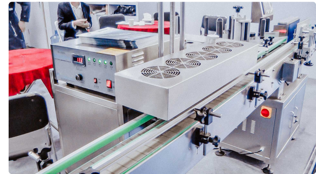
Automatic feed and put cap on plastic capping bottles

Pharmaceutical Tablet Press • 09.12.2020 • 105.471K views