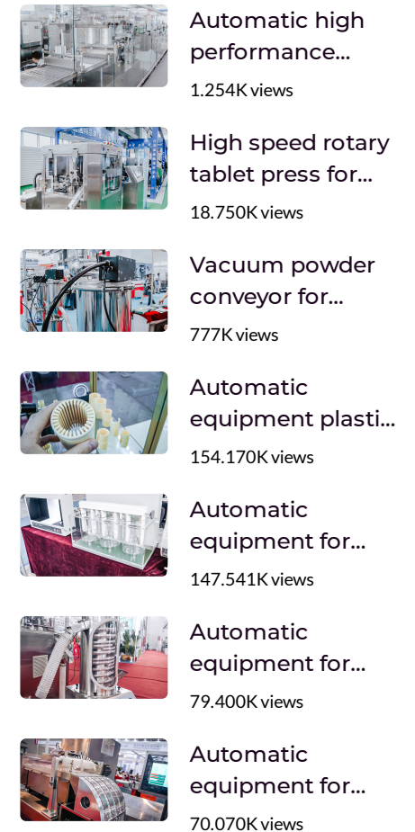
Soft gel oval shape capsules with omega 3 oil equipment