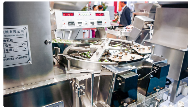
Automatic equipment for counting and packing of gelatin capsules and pills into bottles

Pharmaceutical Tablet Press · 14.09.2020 · 955 views