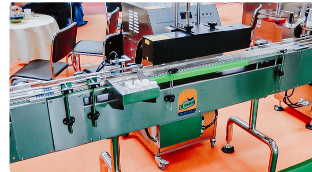
Automatic packaging line for tablets and capsules in plastic bottles capping and labeling

Pharmaceutical Tablet Press · 05.11.2020 · 115.780K views