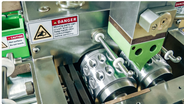
Automatic equipment for production of soft gel capsules with oil in pharmaceutical production Pharmaceutical Tablet Press • 10.12.2020 • 97.541K views