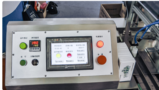
Automatic equipment group packing bottles in cellophane in pharmaceutical production Pharmaceutical Tablet Press • 04.12.2020 • 100.700K views