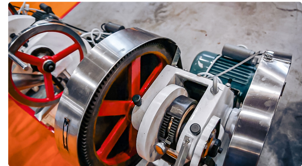
Automatic laboratory equipment for pressing tablets Pharmaceutical Tablet Press • 04.11.2020 • 74.105K views