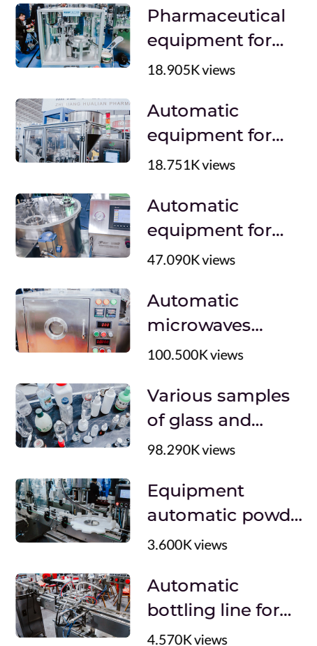
Sublimation lyophilic dryer for powder production from food and pharmaceutical liquids FRANCE