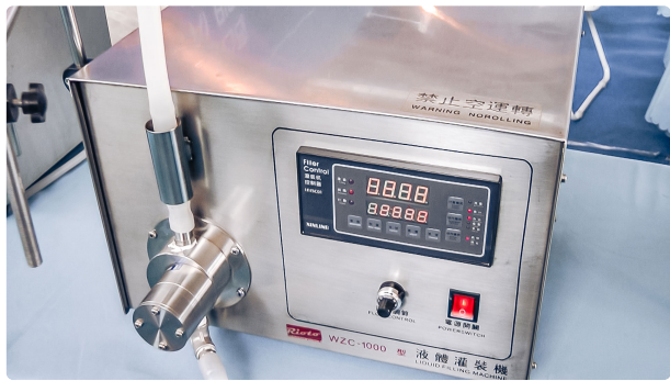
Automatic equipment for dosing liquids in pharmaceutical production Poland

Pharmaceutical Tablet Press • 10.12.2020 • 147.950K views