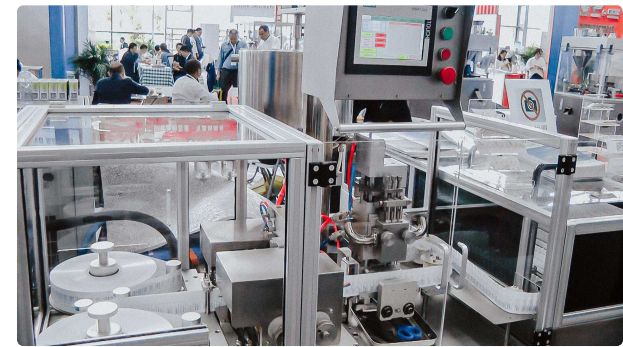
Filling and sealing equipment molded tape suppository with the drug

Pharmaceutical Tablet Press • 23.11.2020 • 450K views