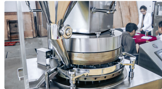
Automatic speed tablet pressing equipment in pharmaceutical production

Pharmaceutical Packaging • 25.09.2020 • 9.857K views