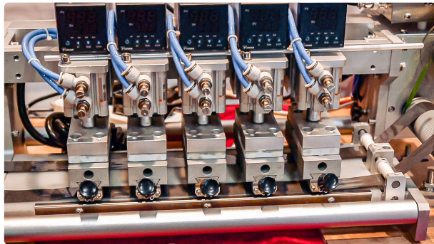
Automatic equipment for printing the shelf life on roll materials Germany

Pharmaceutical Tablet Press • 23.11.2020 • 50.500K views