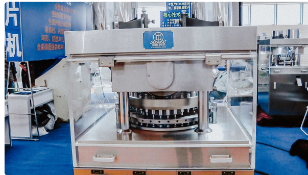
High capacity automatic rotary tablet press for the production of various forms of tablets

Pharmaceutical Tablet Press • 23.11.2020 • 50.500K views