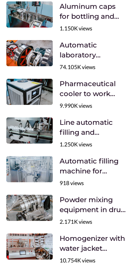
V-mixer for mixing powders in the pharmaceutical laboratory and blending production