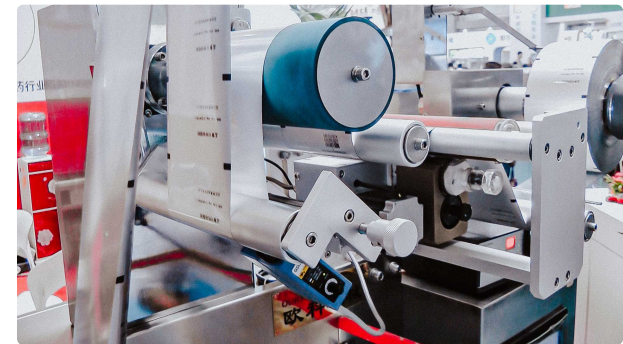
Automatic packaging machine for filling pellets in plastic bags sachets

Pharmaceutical Tablet Press • 10.09.2020 • 1.400K views